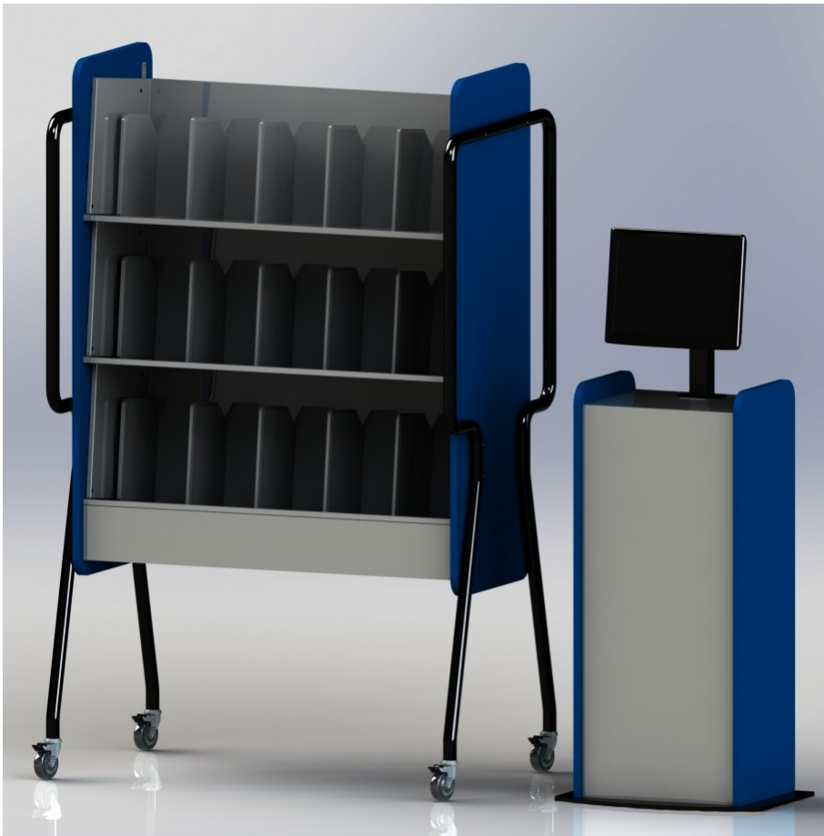
Libshelf - blue unit